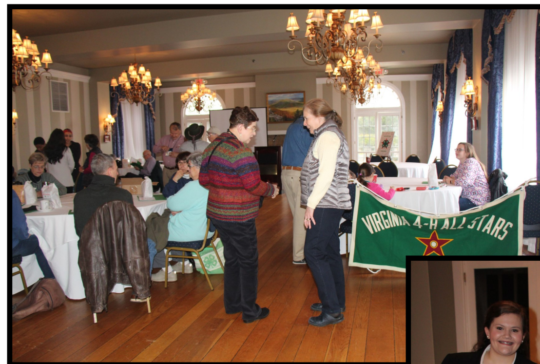
Gathering before the Business Meeting