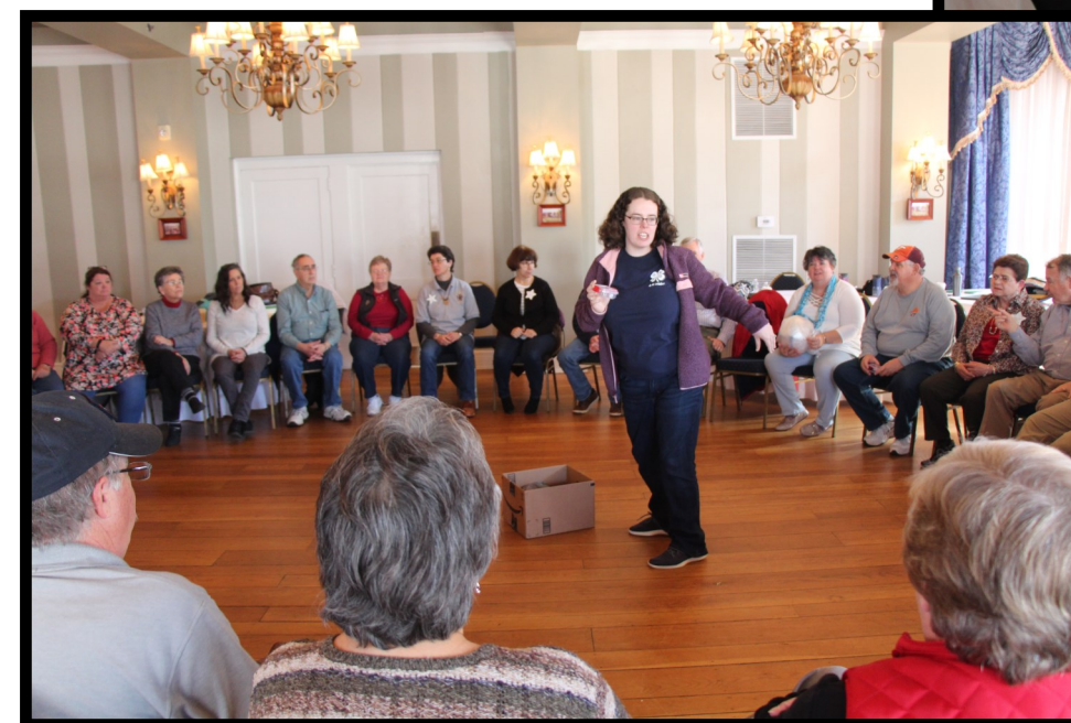
Get Acquainted Activity